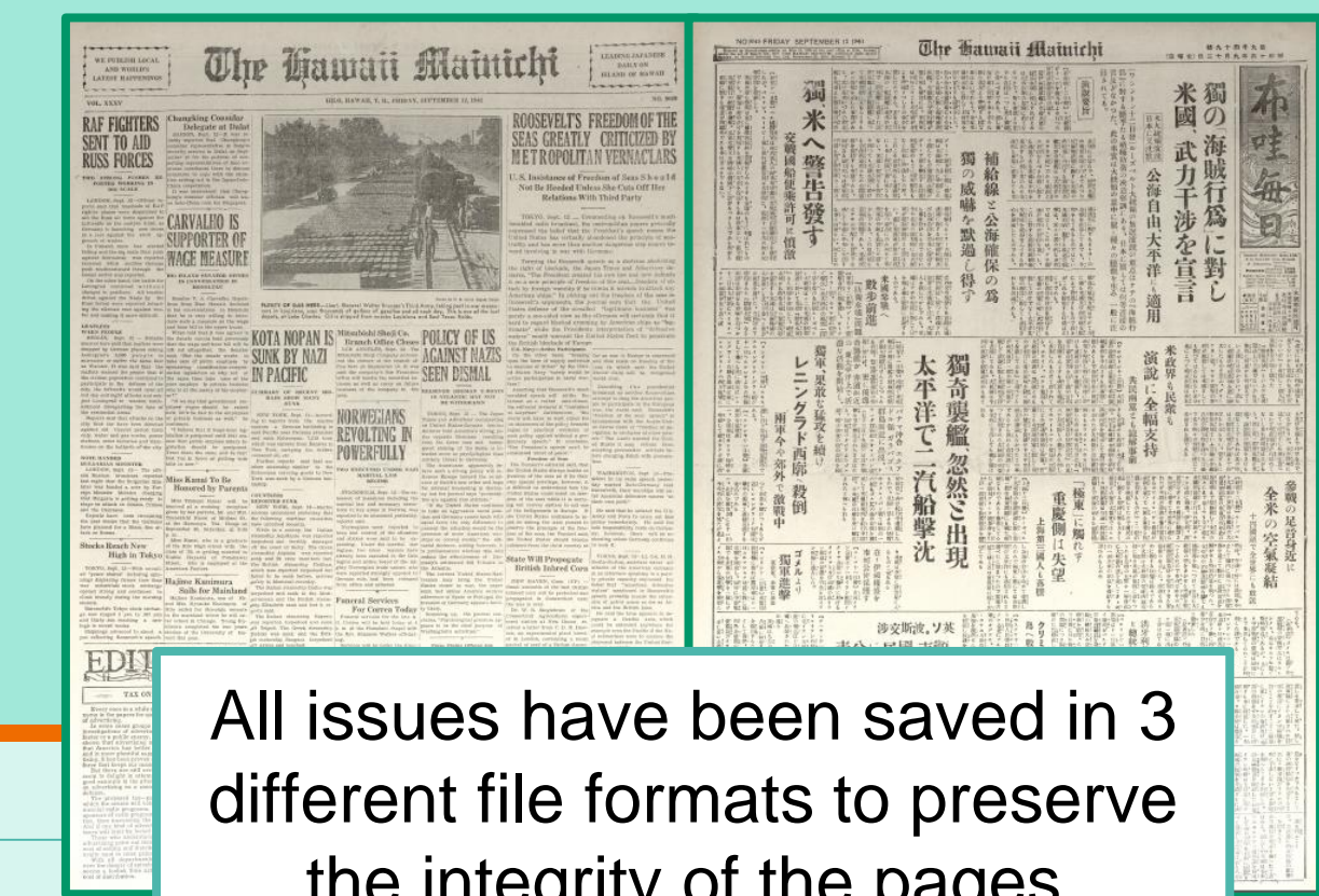
All issues have been saved in 3 different file formats to preserve the integrity of the pages.