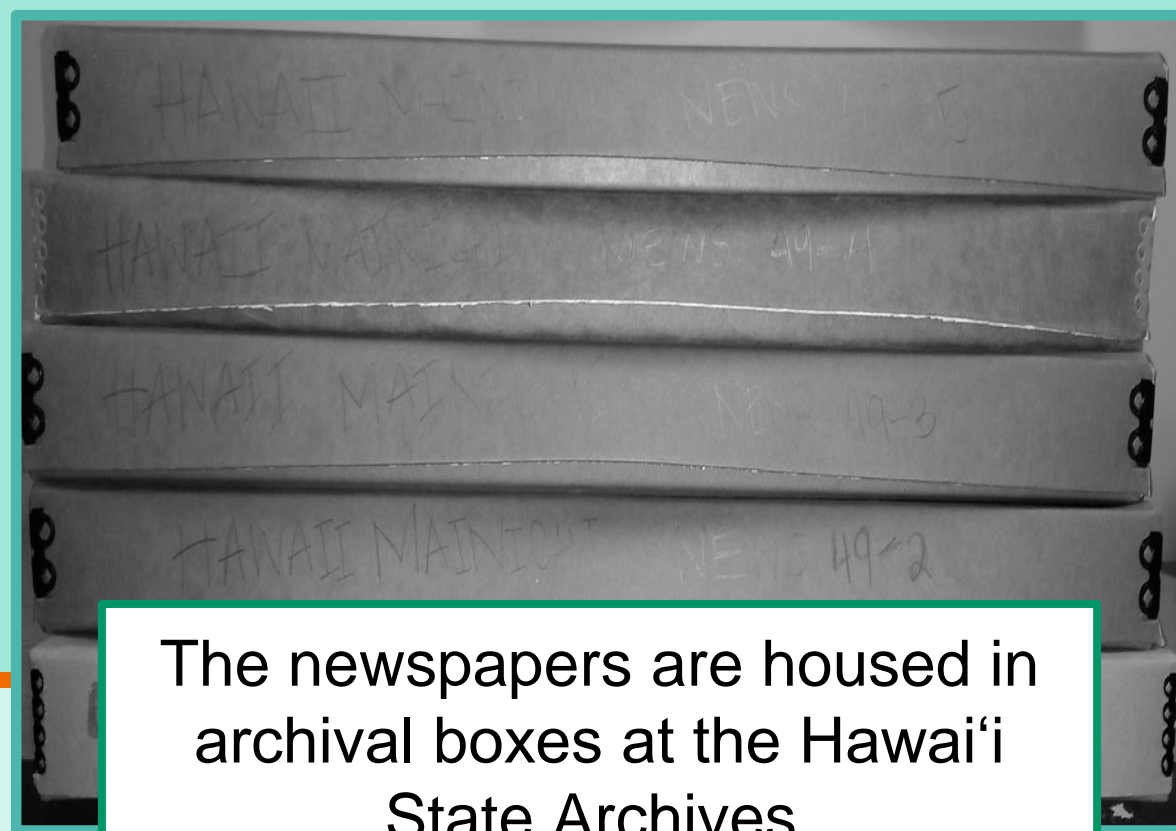
The newspapers are housed in archival boxes at the Hawai'i State Archives.